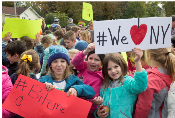
UPES Crunch October 25, 2018