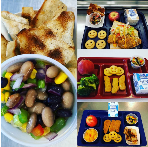
Faye's NY Bean Salad