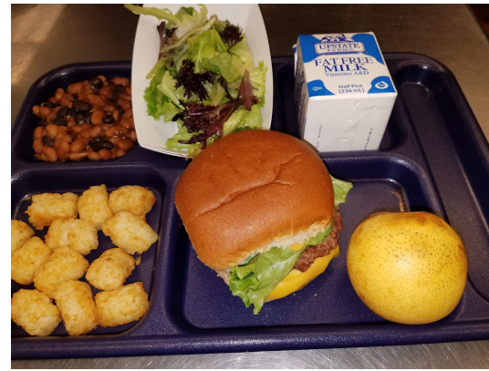
Bandit Beans made with Bush's Vegetarian Beans and NY Black & Pinto Beans (Jan HOM)