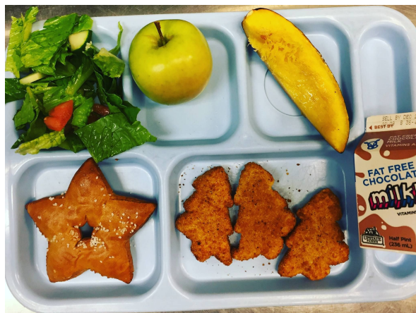
Tis the Season! Acorn Squash Wedge from Bipperts Farms