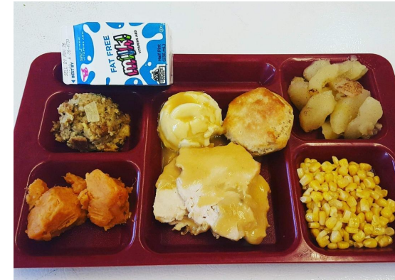
Thanksgiving Turkey Dinner