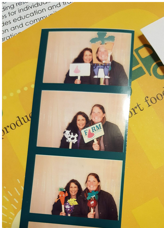
At BPS F2S Kick-off October 23, 2018