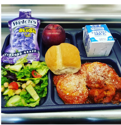
New! NY Concord Grape Slushie